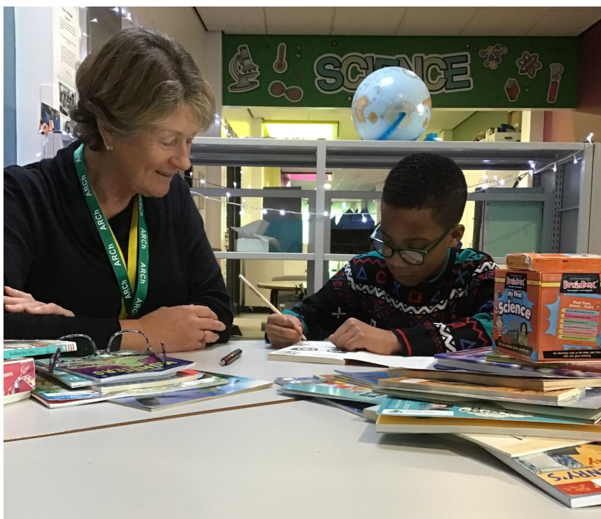
An ARCh volunteer reading with a child. ARCh's work helps improve educational attainment in Oxfordshire.

This in turn supports the OIEP's aim of increasing educational attainment in the County as well as the Strategic Vision outcomes that 'Our residents will be healthier and happier, and overall wellbeing will have improved' and 'Our local economy will be globally competitive, sustainable, diverse and inclusive'.